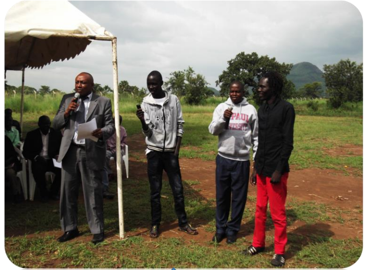
Representative of PS giving a speech during the graduation