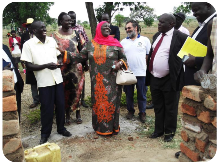
Hon. Min. Gender, Labour & Social Dev't and Hon. State Min. Karamoja affairs inspecting Masonry practicals/bricks work