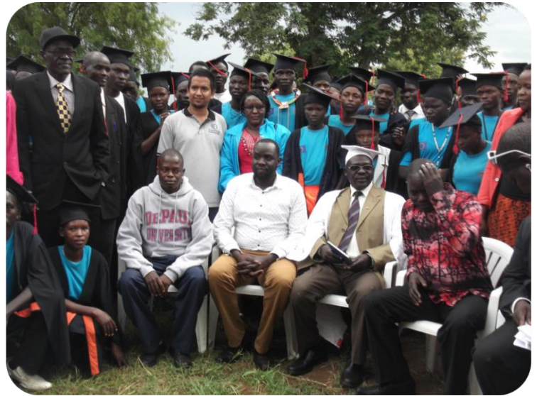
RDC, LCV and other stakeholders in a group photo with graduants