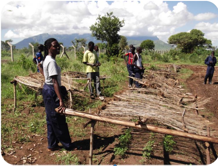
Nursery bed for vegetables