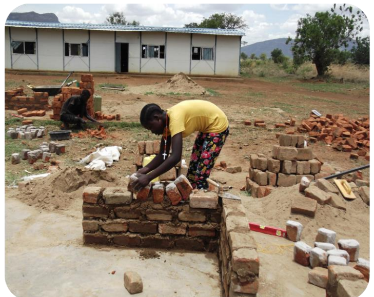
A female trainee setting a foundation