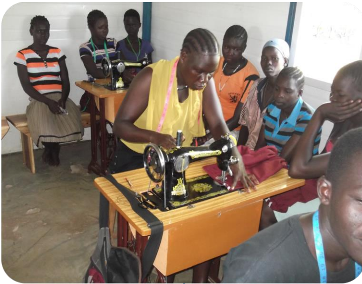
Tailoring session going on at Kobulin