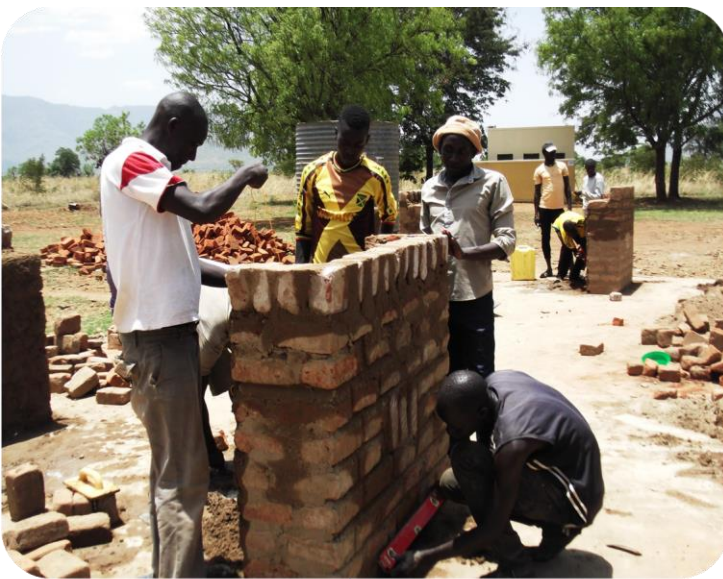
Trainees constructing the wall at Kobulin during practical training