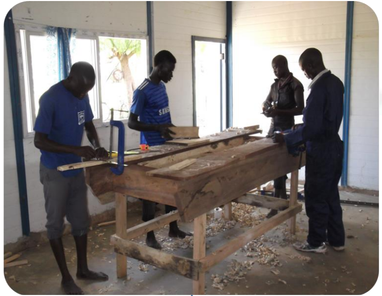
Trainees during Carpentry session at Koblin