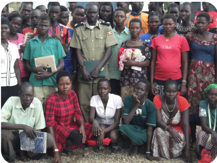
Regional Police Commander in a group photo with the trainees after life skill session on conflict management