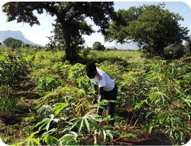
Casava plantation at Kobulin