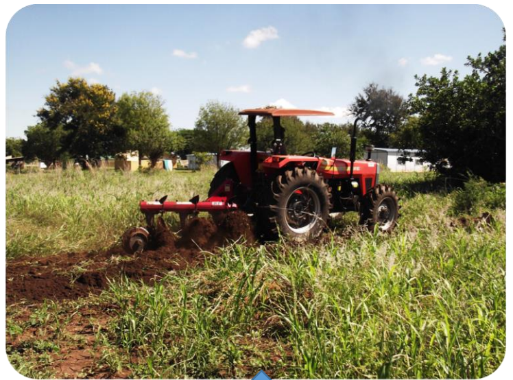
Tractor opening land for cultivation