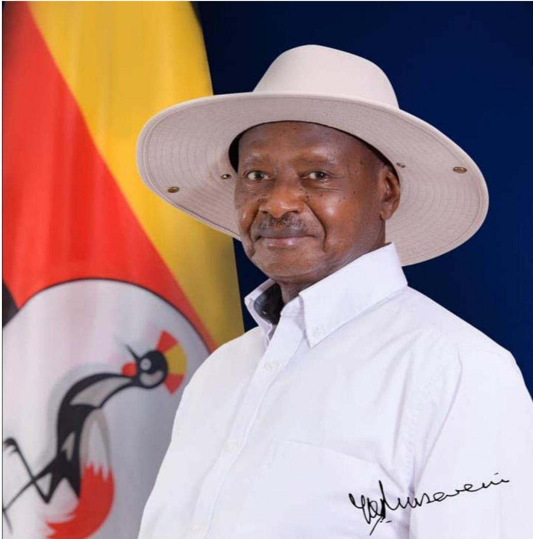
H.E. GEN. YOWERI KAGUTA MUSEVENI PRESIDENT OF THE REPUBLIC OF UGANDA